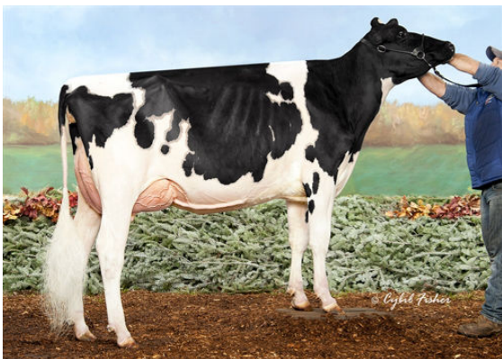
WESTCOAST ORION ARYANE 4727