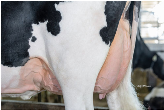
WALNUTLAWN ORION SUNSHINE