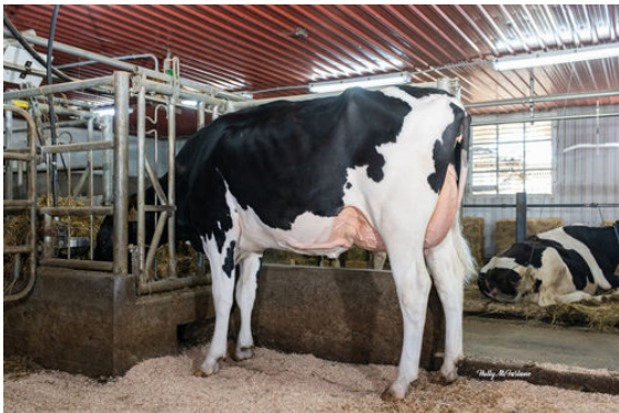
WALNUTLAWN ORION SUNSHINE