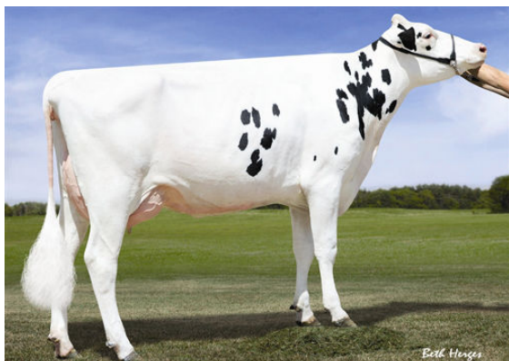
DYMENTHOLM SUNVIEW SCOBY