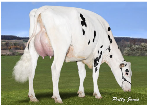
STANTONS CG ERIKA

GLPI +2506 PRO$ 335 VG-CAN SP DPF RDF BLF CNF BYF CVF HH1F HH2F HH3F HH4F HH5F HH6F HCDF HMWF