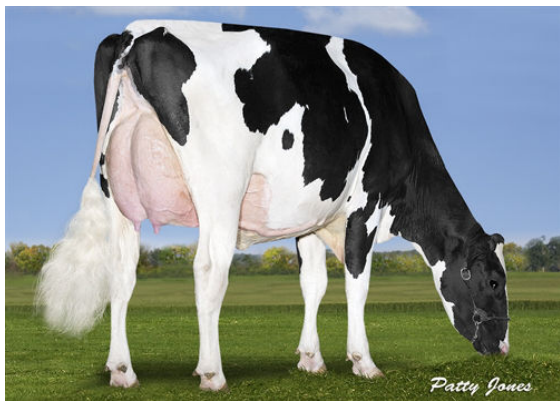
MAPEL WOOD CGAIN LOTTO P