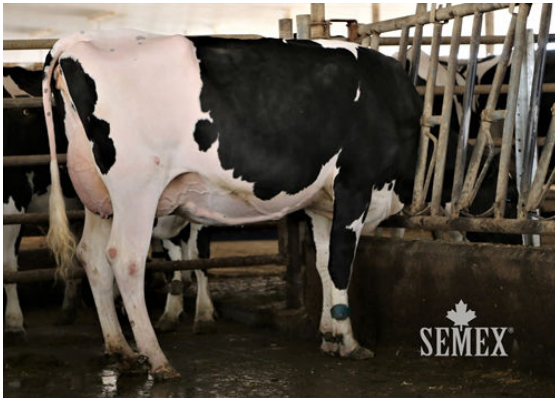
PELLERAT KANE FALBALA