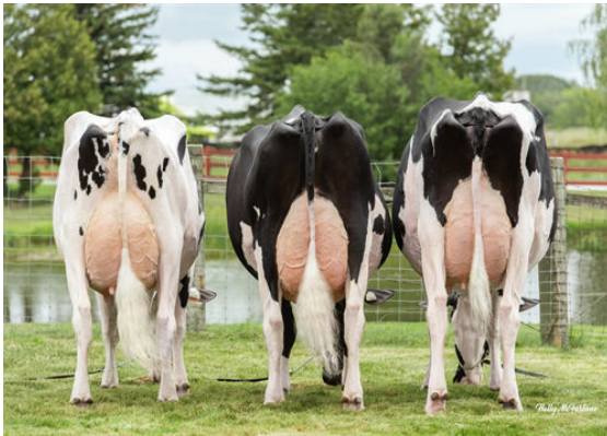
SOLOMON DAUGHTERS 3 L-R QUALITY SOLOMON LOVELY, QUALITY SOLOMON LUSTFUL, QUALITY SOLOMON LUST