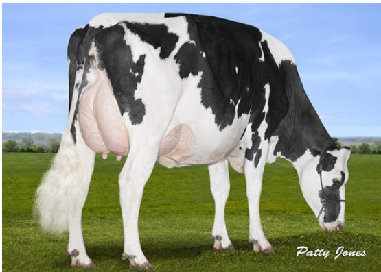
EARLEN SOLOMON MANDY