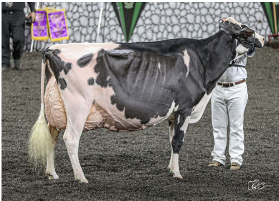
OAKFIELD SOLOM FOOTLOOSE DAUGHTER