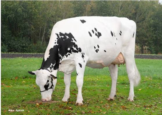
DIEKERS K&L DL WHISKEY DAM