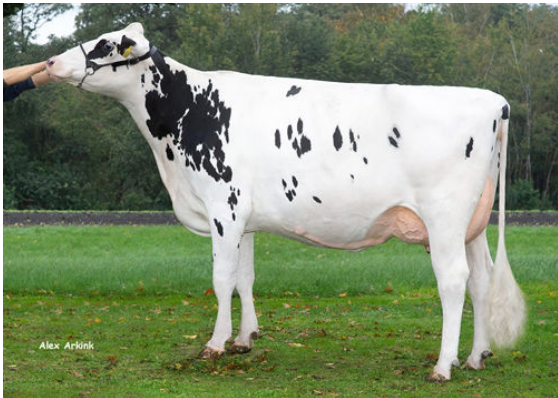
DIEKERS K&L DL WHISKEY DAM