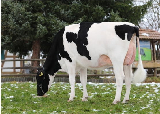
MATTENHOF TATOO HOPE DAM