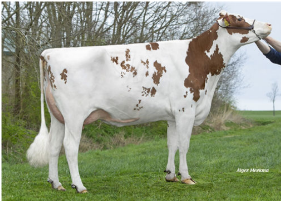
LAKESIDE UPS RED RANGE DAM