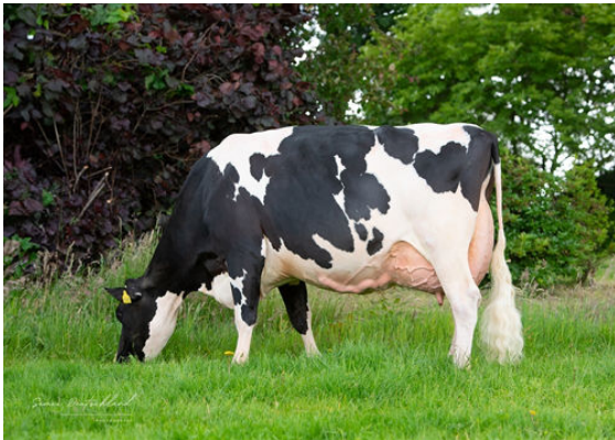
DE OOSTERHOF DG ROSE D GRANDDAM