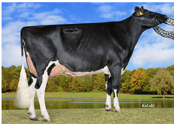
WILDER HERZ-P GRANDDAM