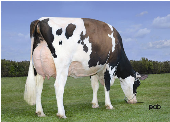
KHW-I AIKA BAXTER Dam