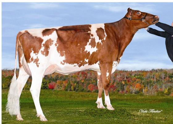
DUDOC MITEY PESTICIDE P RED