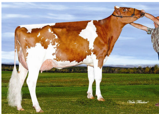
LORKA ILLEGAL PESTE PO