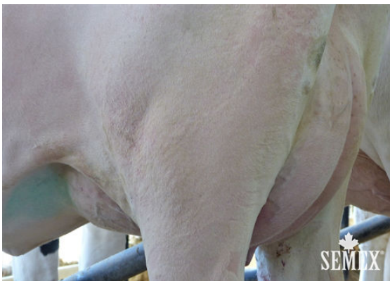
DESLACS INTEGRAL ANARICK