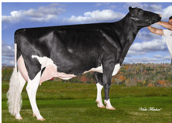
AMITIES GOLDWYN LOVER