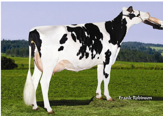
JAQUET CARRIBEAN AMOLIE