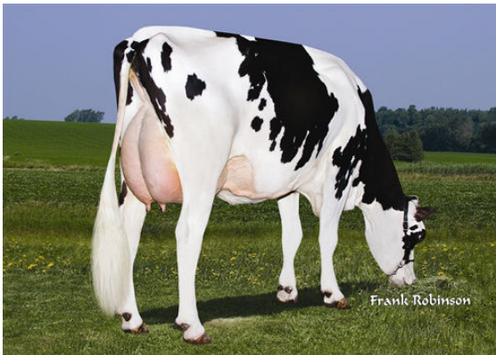
SWISSKES CARRIBEAN GLITER