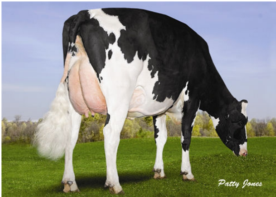
COOKHILL CARRIBEAN XEROX