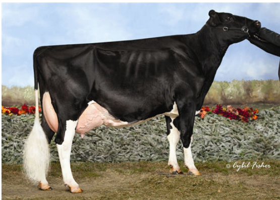
AGRIVENTE SEAVER LORETTA