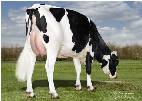
BLASER DIRECTION 5381