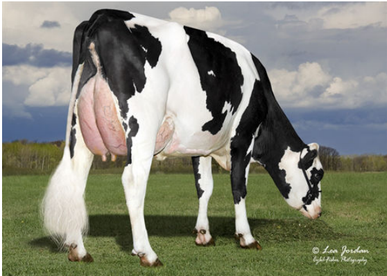
SGD ONE DIRECTION 18076