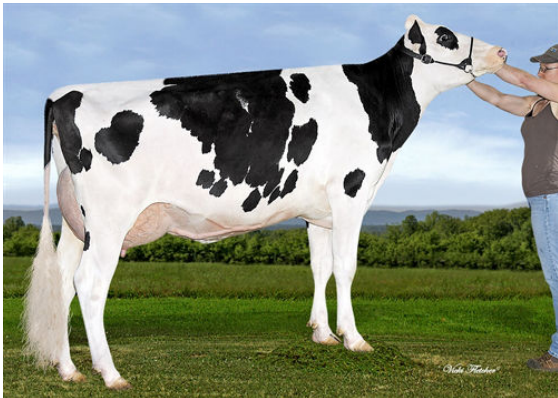
CLERINDA ONE DIRECTION TUNESIE