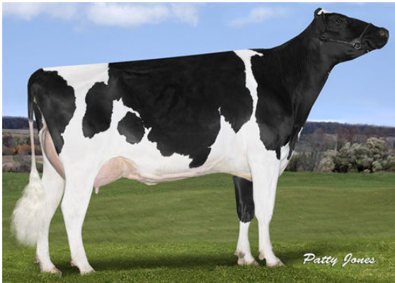
STANTONS JETSET ESIRNUSA