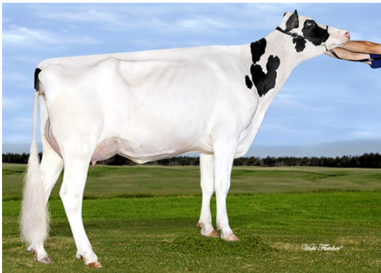
ADMAUGARD ALPINE DEVISE