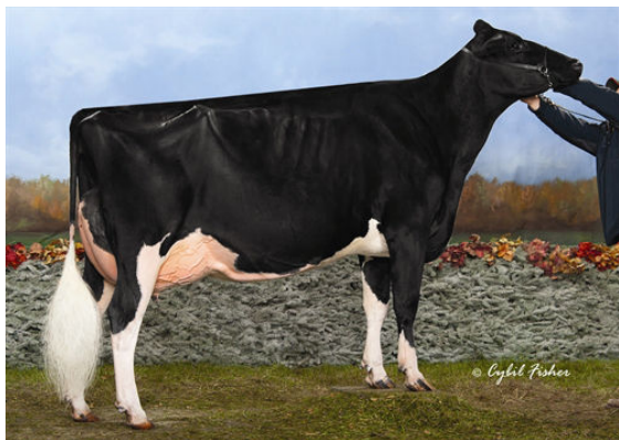
BRACKLEYFARM CHELIOS CHEERIO