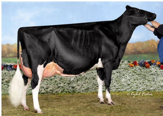
BRACKLEYFARM CHELIOS CHEERIO