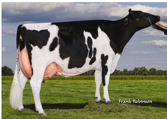
AIR-OSA CHELIOS 14354