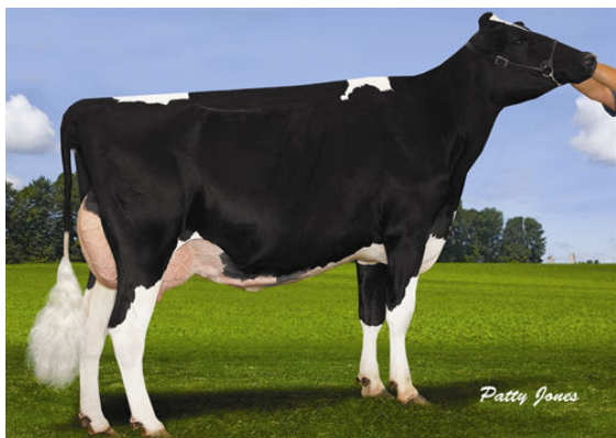
FLEVOHILL SLEEMAN TIPPY