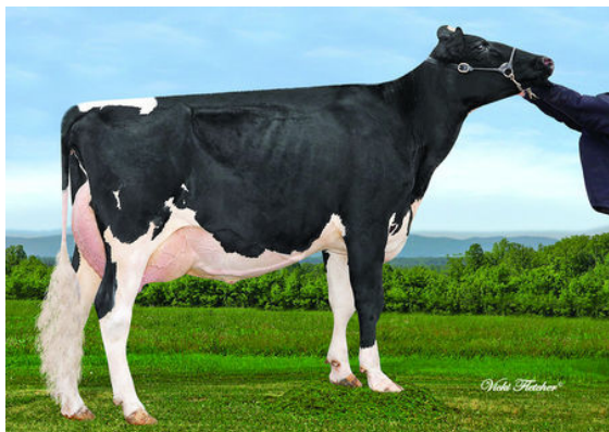
REDSTONE SLEEMAN PHILIPPA