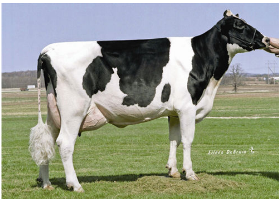
EVER-GREEN-VIEW ELSA FOURTH DAM