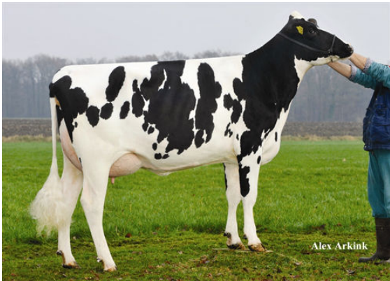
BROEKS MADISON GRANDDAM