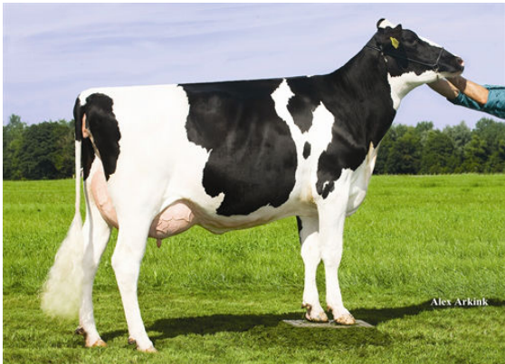
BROEKS ALSFELD DAM