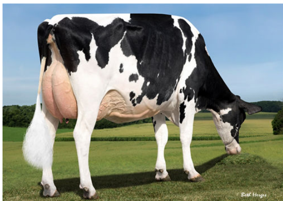
SANDY-VALLEY SALOON 5203