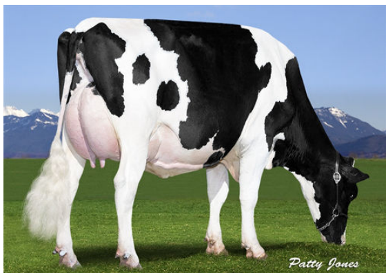
DOLPHIN SALOON 925