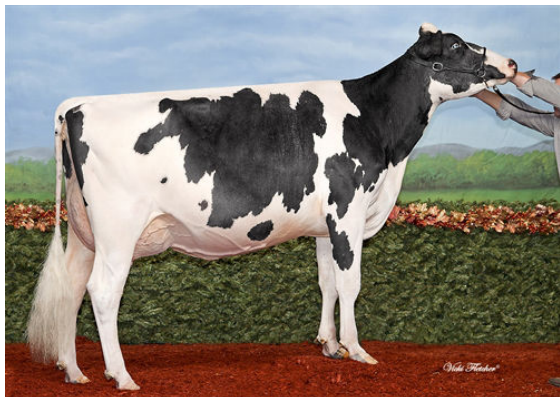
STEVAIN SALOON NOUKY