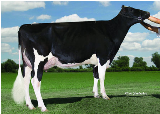
EAGLE-VIEW TEMPTING CURLY