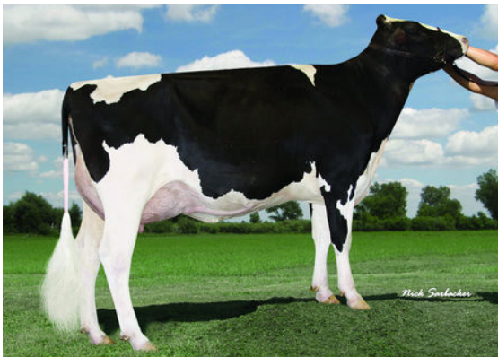
EAGLE-VIEW TEMPTING VAMPIRE