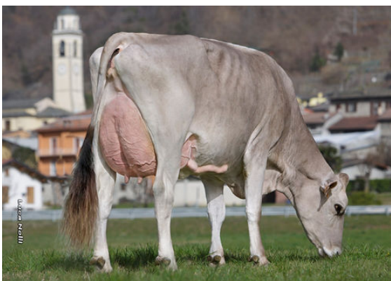
KIBAFARM FALCO RISOTTA