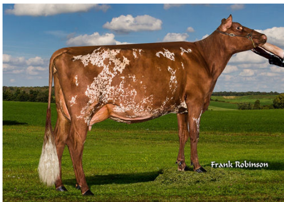
LAROC PREDATOR CONTESS FOURTH DAM