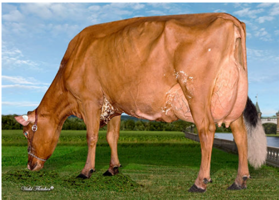
BELLEROUTE TUXEDO RIHANA DAM