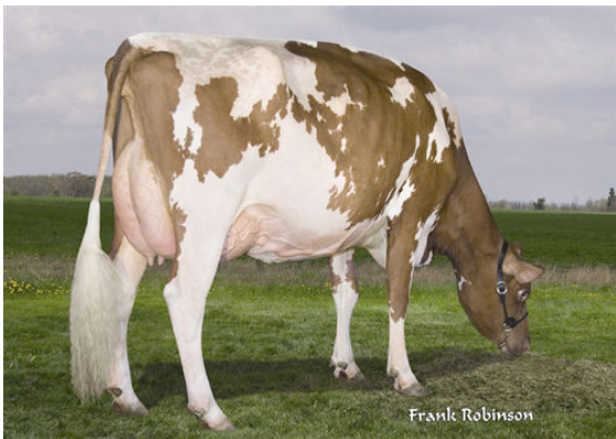
DE LA PLAINE RHYTHM ROMI THIRD DAM