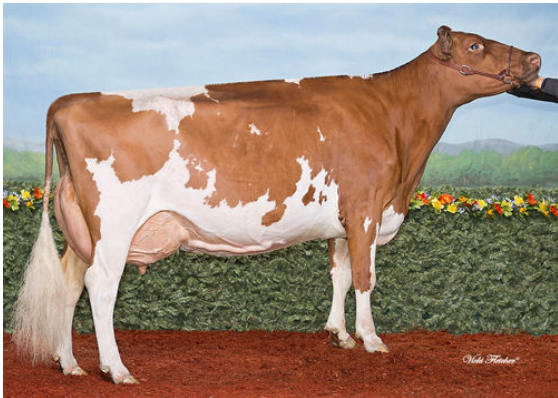
DE LA PLAINE PRIME ROCKY GRANDDAM