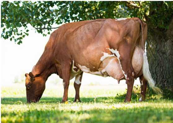
MARBRAE OBLIQUE'S CAMBRIDGE THIRD DAM