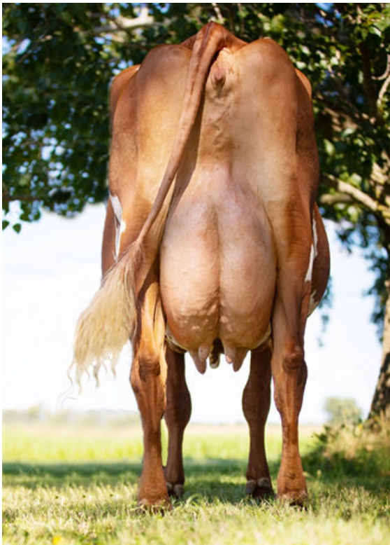
MARBRAE ARBITER'S CATALINA GRANDDAM