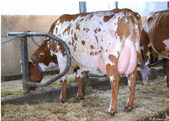
DES RASADES ASLAN C GLADICE DAM