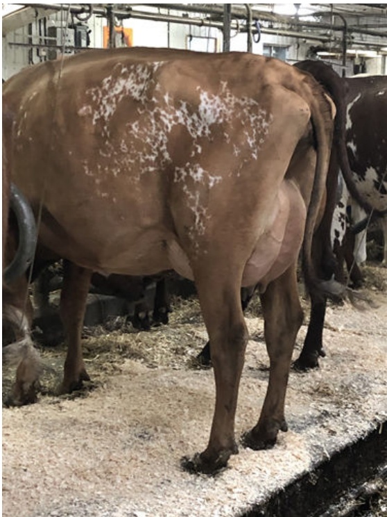
LA CROISEE TUXEDO FLASH GRANDDAM