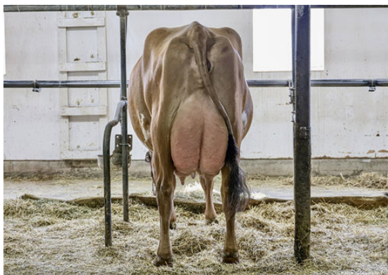
LAROC YELLOW MOCHI DAM