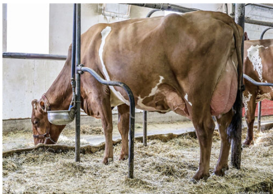
LAROC YELLOW MOCHI DAM