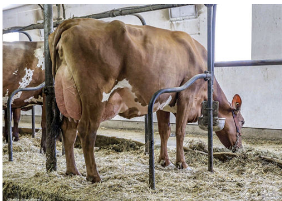
LAROC YELLOW MOCHI DAM