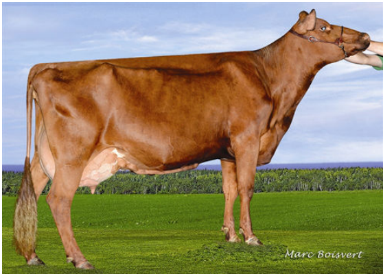
KAMOURASKA ORRA XUBY GRANDDAM