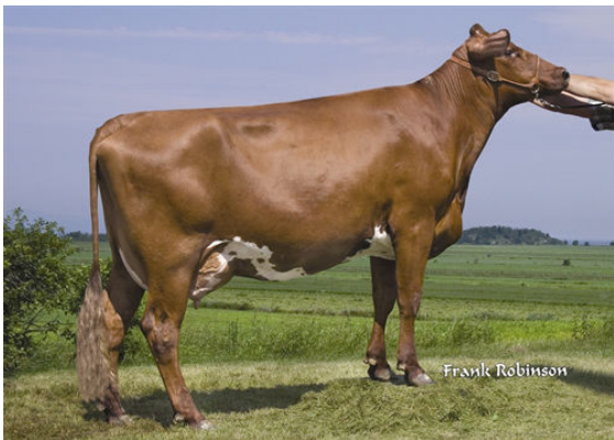
KAMOURASKA PETERSLUND RUBY THIRD DAM