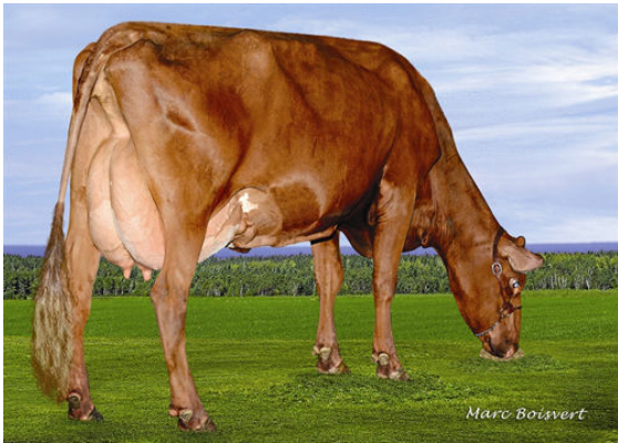
KAMOURASKA ORRA XUBY GRANDDAM