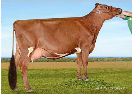
DUO STAR AMITIE THIRD DAM