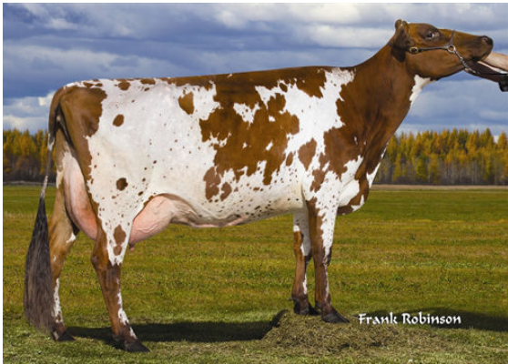
DUO STAR AMOUR FOURTH DAM