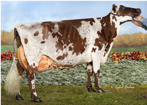
MARGOT PATAGONIE DAM