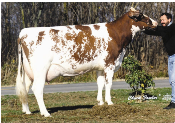
KELLCREST HAPPY SPIRIT FIFTH DAM