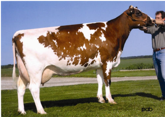
LACHUTE ROAD H S SALEM FOURTH DAM