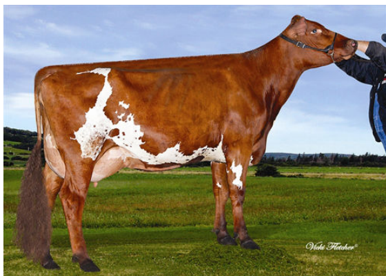
VISSERDALE SELENA 3 GRANDDAM