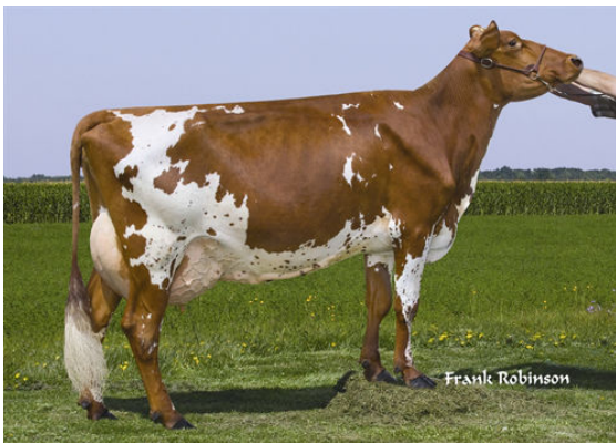
LA SAPINIÈRE FACY-B THIRD DAM