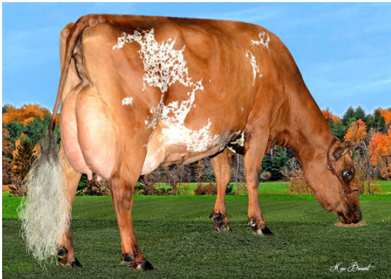
DUO STAR BURDETTE AMARA DAM