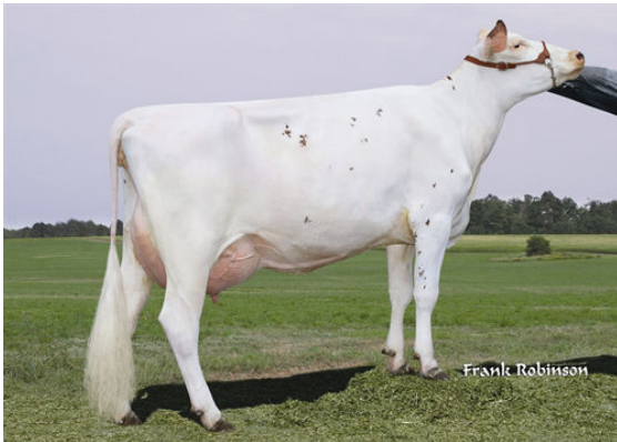
KELLCREST MIRACLE GRANDDAM