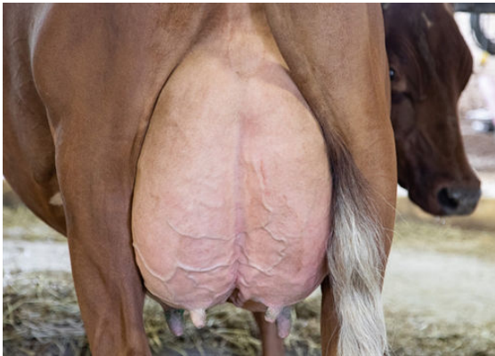
LA CROISEE AMAZING FLICKA