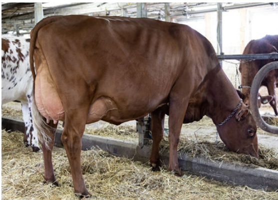
LA CROISEE AMAZING FLICKA