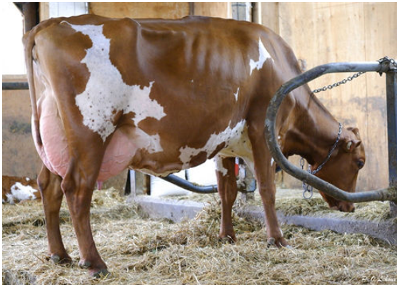
DES RASADES AMAZING GABY DAUGHTER