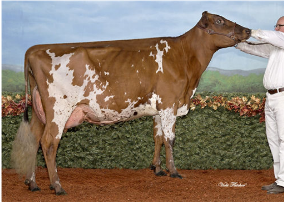
MONEY MAKING RUBICOM MANGUEL