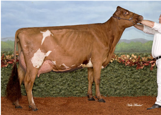
CADRIJO RUBICOM MAMZELL