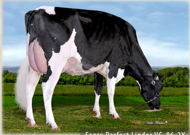
Fepro Perfect Lindor VG-86-2Y